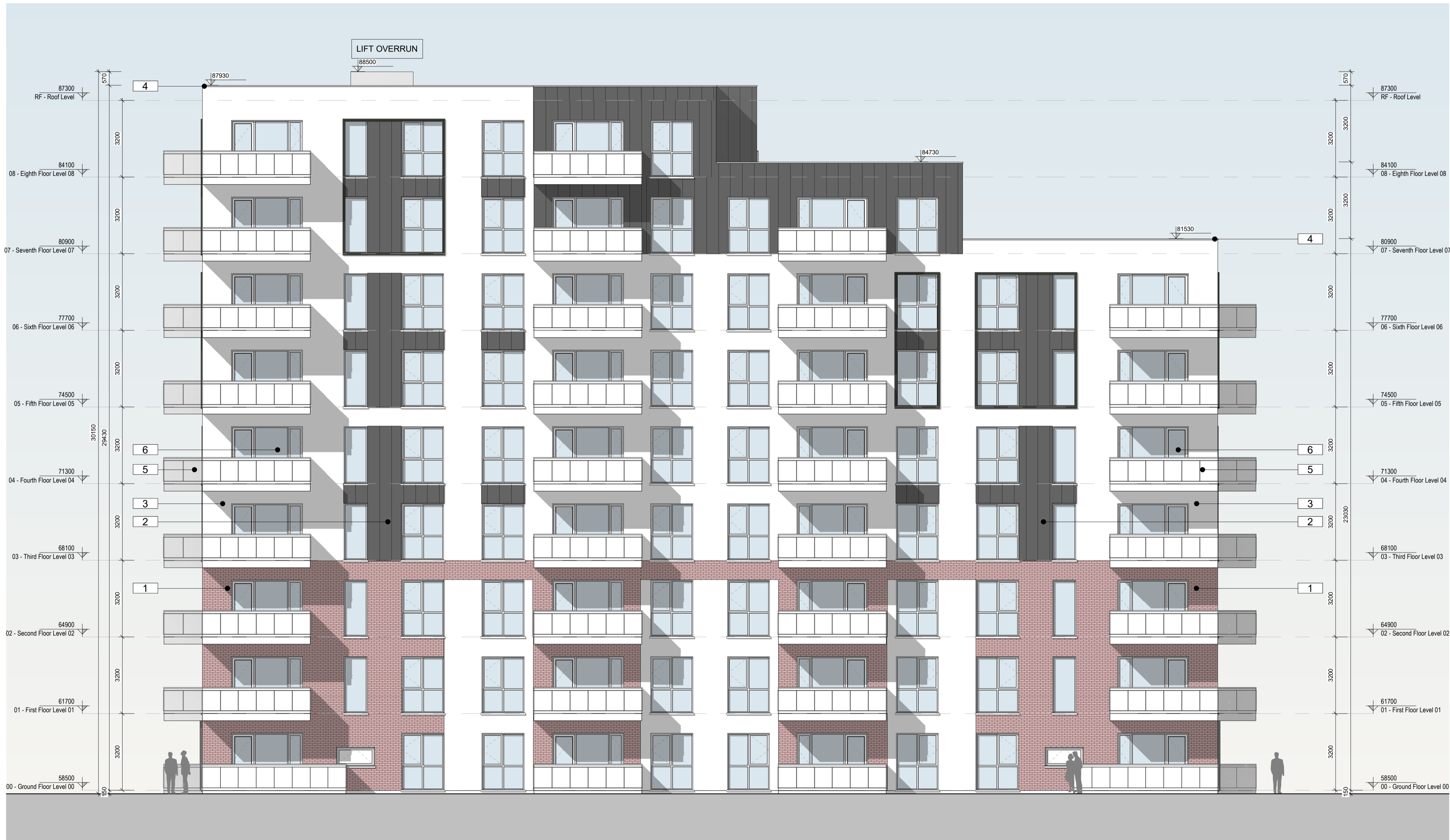
1 East Elevation 1 : 100

Please consider the environment before printing this sheet